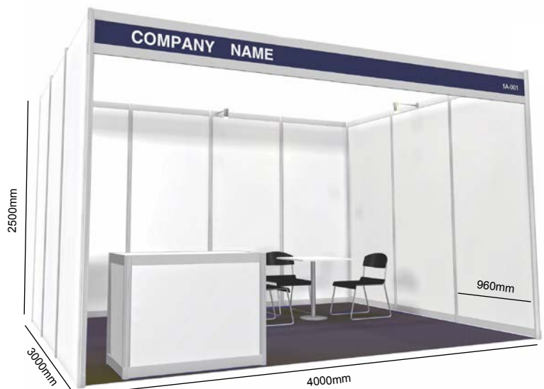
Example of a 12 sqm Shell Scheme (non-contractual graphic)