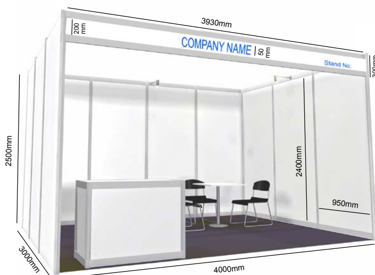
Example of a 12 sqm Shell Scheme (non-contractual graphic)